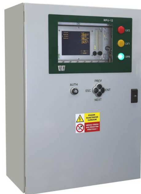
RPU-12 Radiation Processing Unit

Calibration jigs (solid state source with a holder)